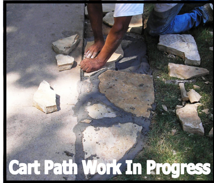
Cart Path Work In Progress