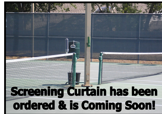
Screening Curtain has been ordered & is Coming Soon!

Join Us Every Week For The Popular Sunday Brunch Buffet