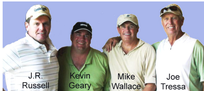
Can They Win The Next Event?