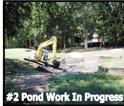
#2 Pond Work In Progress

For an up-to-date visual of the projects take a look at the display in the hallway outside the Sports Grill!