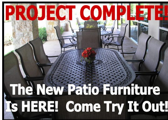
PROJECT COMPLETE! The New Patio Furniture Is HERE! Come Try It Out!

These projects are just the beginning! The Member Partnership Fund is accumulating money each month for additional projects!