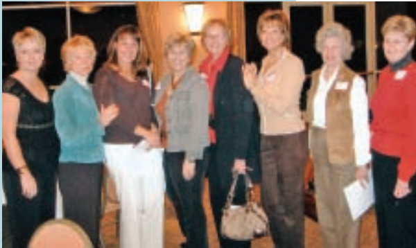
EWGA New Members