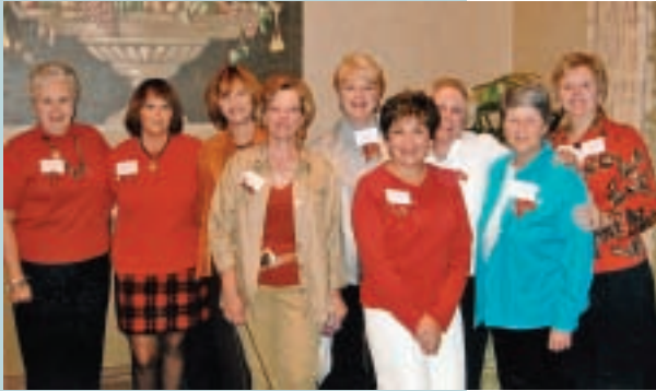
EWGA New Board