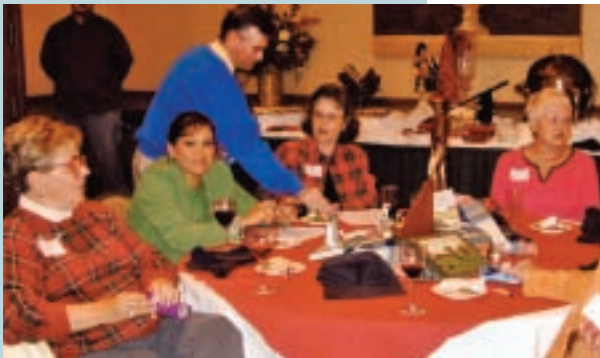
EWGA Welcoming Cocktail Party