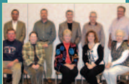
Board of Governors

Fried Calamari • Country Fried Steak and Gravy • Fried Catfish