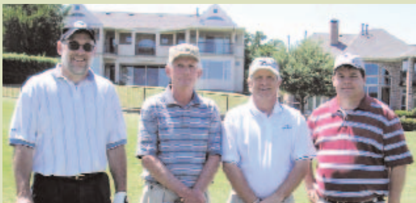
President's Cup Flight Champions