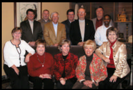
2008 BOARD OF GOVERNORS