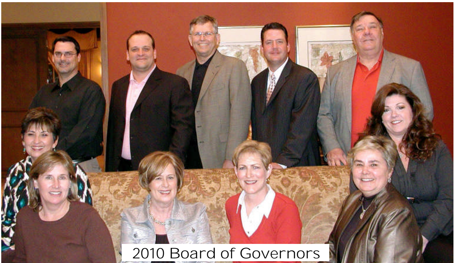
2010 Board of Governors